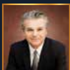
REV. JENTEZEN FRANKLIN